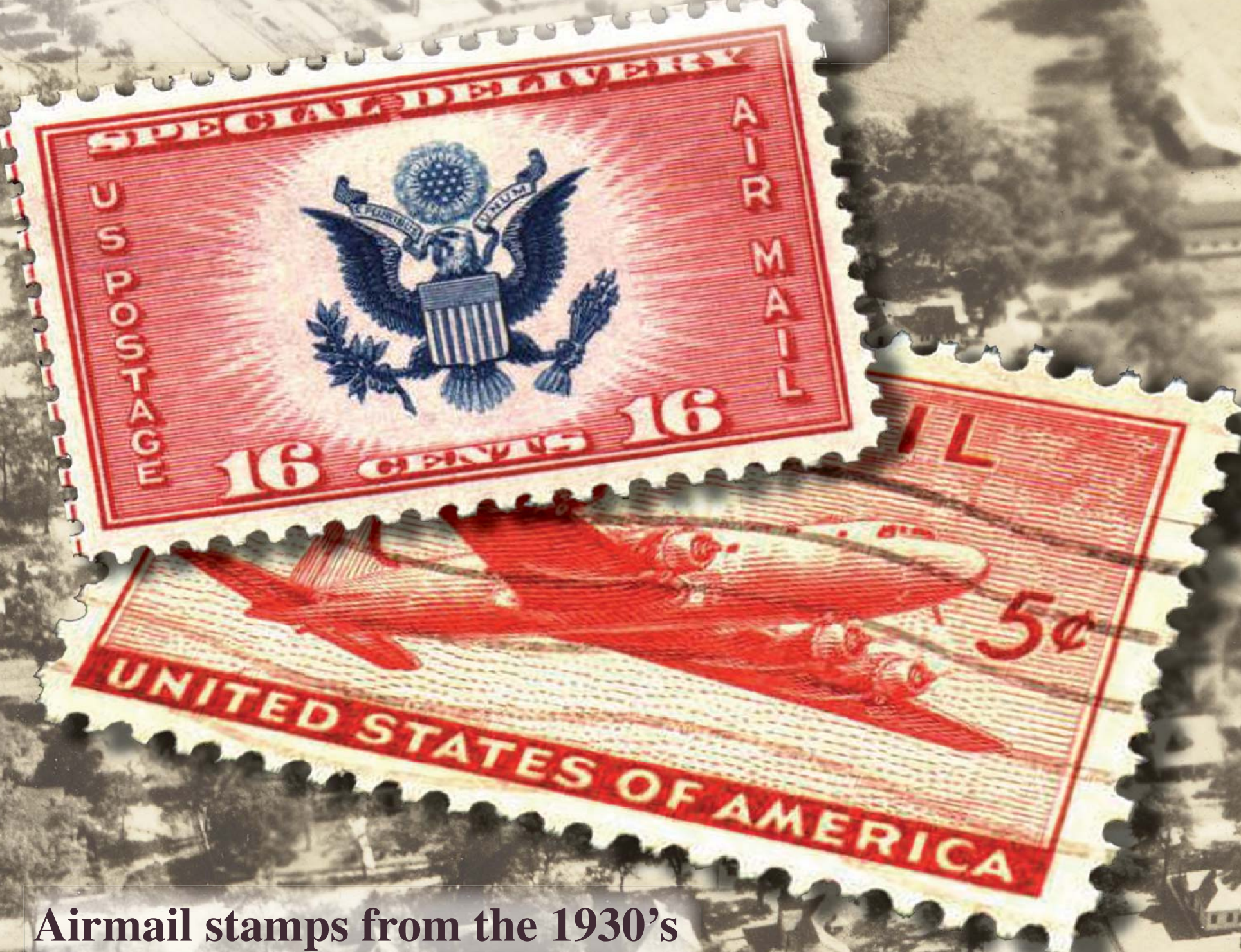
Airmail stamps from the 1930's

The first playground at McCabe Park, the athletic field and the nine-hole golf course, were constructed by the Works Progress Administration (WPA). The second nine holes were constructed in 1947, and the former runways of McConnell Field became McCabe Park Golf Course.