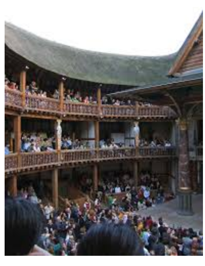
Tour of the Globe Theatre

Holy Trinity Church, site of Shakespeare's baptism and burial