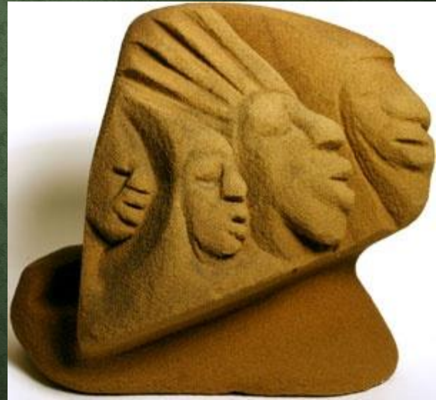
Lonnie Holley, untitled