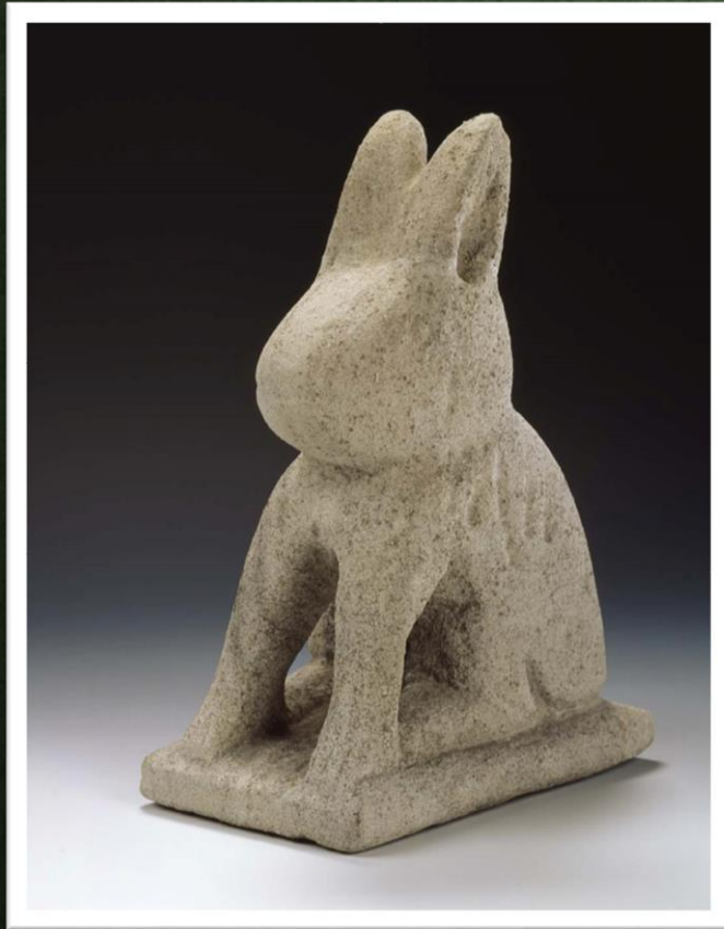
William Edmondson, Rabbit

http://www.bing.com/images/search?q=william+edmondson+sculptures&qpv=william+edmondson+sculptures&FORM=IGRE#view=detail&id=357C0A78CBD37FB44EACE40C36AFC9D59F7B6CA6&selectedIndex=3